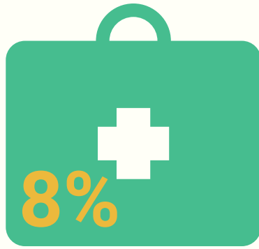
Health and welfare support workers