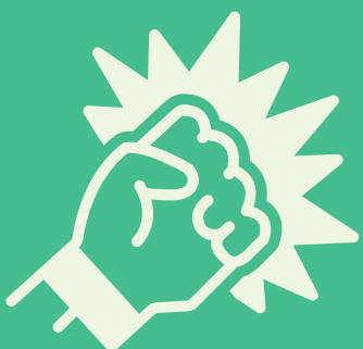
Exposure to workplace or occupational violence