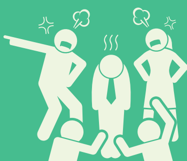
Work-related harassment or bullying