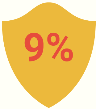
Defence force members, fire fighters and police